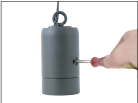
Select Warm White, Pure White, or Cool White (2700K, 3000K or 4000K)