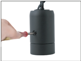
Continuously adjustable brightness