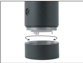
Continuously Adjustable Beam Angles Indexed at 35°, 45°, 55°